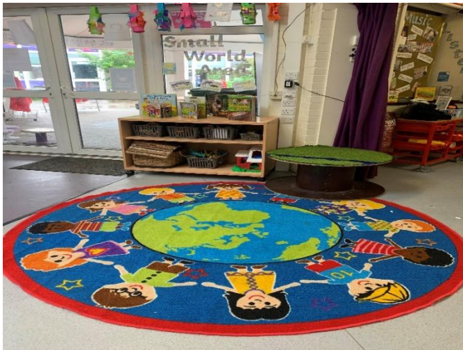
Small World Area