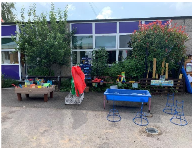
Sand and Water Area