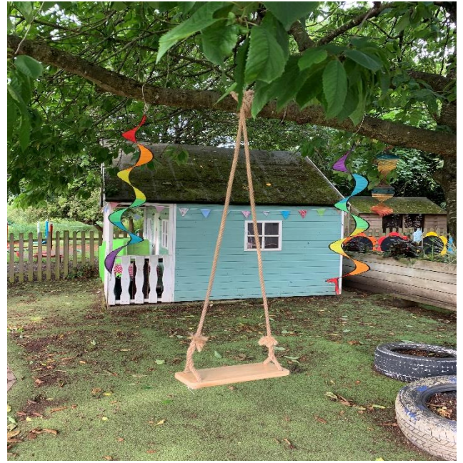
Our Play Cottage and Swing