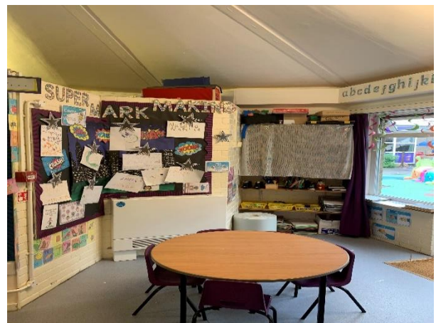
Mark Making Area