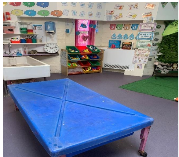
Sand and Water Area