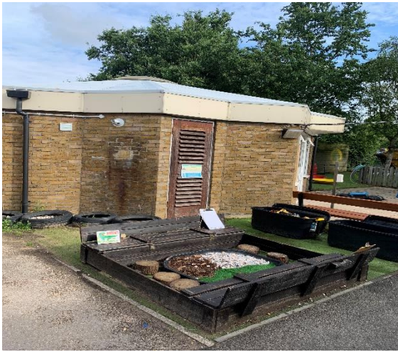
Small World Area

In our outdoor area, we cook in the mud kitchen, look for mini-beasts, dig in the garden, create games and obstacle courses.