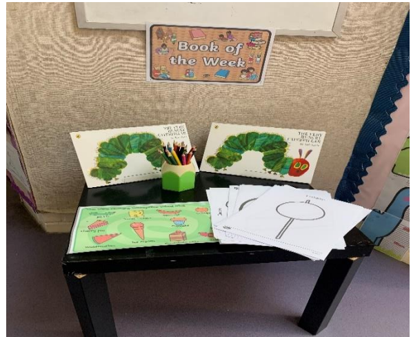
Book of the Week Area