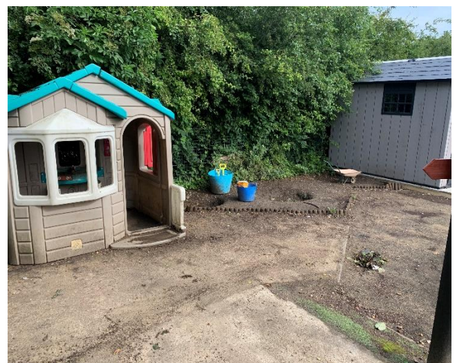
Mud kitchen and Digging Area