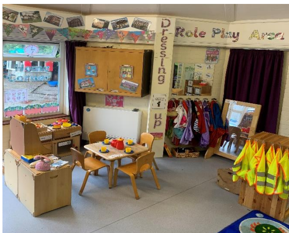
Home Corner and Dressing Up