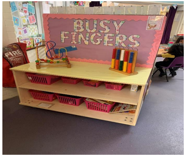
Busy Fingers Area