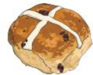
los bollos cruzados de Viernes Santo